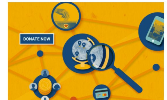
Monitoring the environment for fundraising