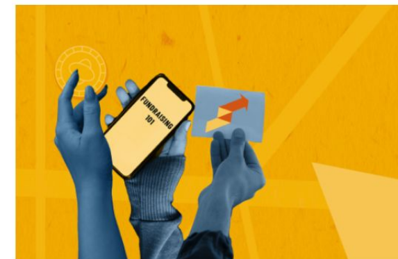
Introduction: fundraising methods and regulations