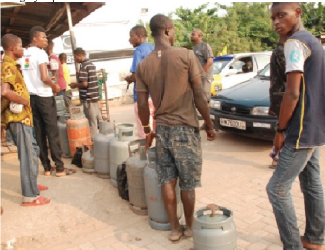
Customers buying LPG at a gas filling station

The recent fire outbreak at a Liquefied Petroleum Gas (LPG) dispensing station at La is a wake-up call for the authorities to come out with permanent solutions to prevent future occurrences.