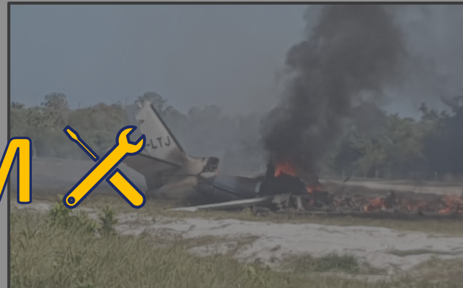
PT-LTJ – C550 – 14 NOV 19 RBAC 91