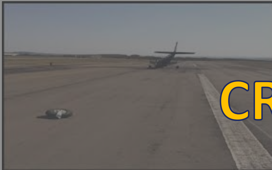
PR-MJW – C152 – 31 JUL 16 RBAC 141