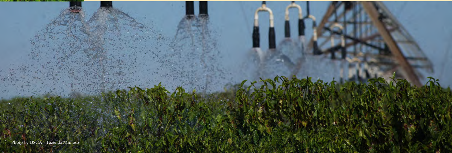
Fazenda Mimoso