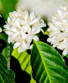
Fazenda Dois Irmãos