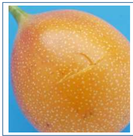
alternative: less severe, but not allowed

Minimum requirement "fresh in appearance". Even though the Codex standard lacks a reference to the possibility of allowing a lack of freshness at the commercial stages following export/dispatch, the working group agreed that this should be made possible via the explanatory notes. Please check whether in this context the lack of freshness is to be specifically allowed only at retail stage - then we would have to mention this explicitly in the explanatory note. Please also check whether gradations by class should also be allowed in this context or whether, for the sake of simplicity, one permissible limit should be shown for all classes.