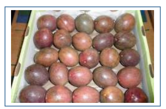
additional photo proposed would this be acceptable in any class?

<u>Packaging:</u> Should the brochure include a photo illustration packaging with fruit packed loose in the package?