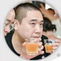
EXPORT DEVELOPMENT PROGRAM