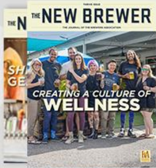
THE NEW BREWER MAGAZINE