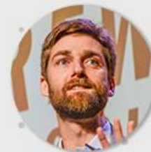
INSIGHTS & ANALYSIS