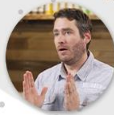
DEPARTMENT OF EDUCATION