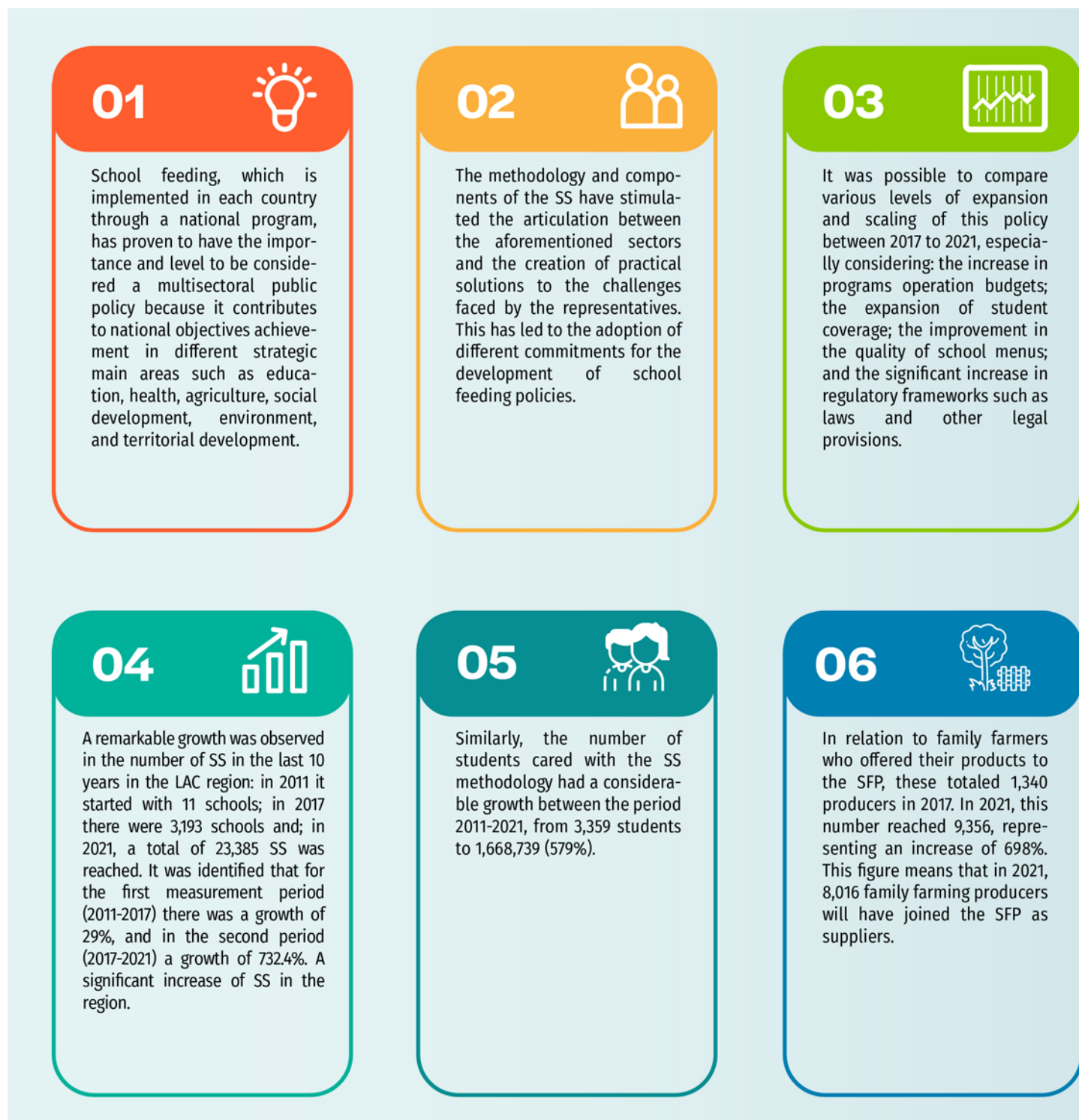
Figure 7: Conclusions of the study on regional Sustainable Schools