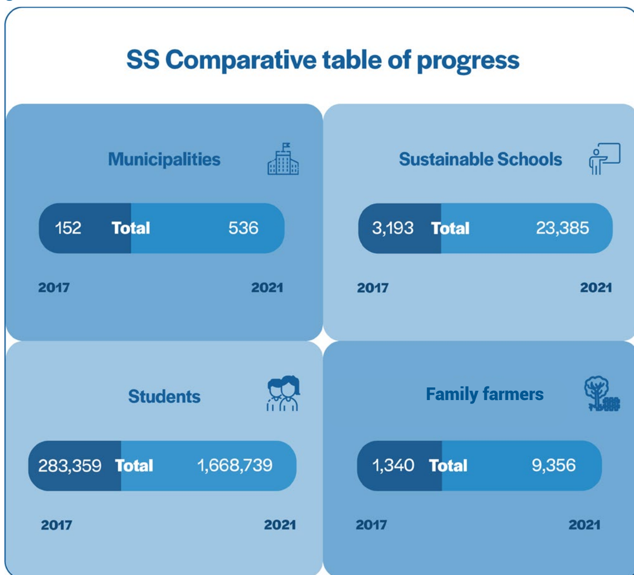
Figure 2: Sustainable schools advances

and that countries such as Panama, Ecuador, and Trinidad and Tobago have also implemented the SS methodology. The following table shows the quantitative progress of the mentioned elements, which occurred in the period from 2017 to 2021 in the region.