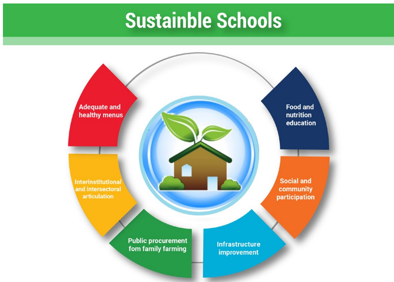
Figure 1: Components of Sustainable Schools

The SS methodology aims to give visibility to a possible practice, with the objective of national scaling and sustainability of school feeding policy.