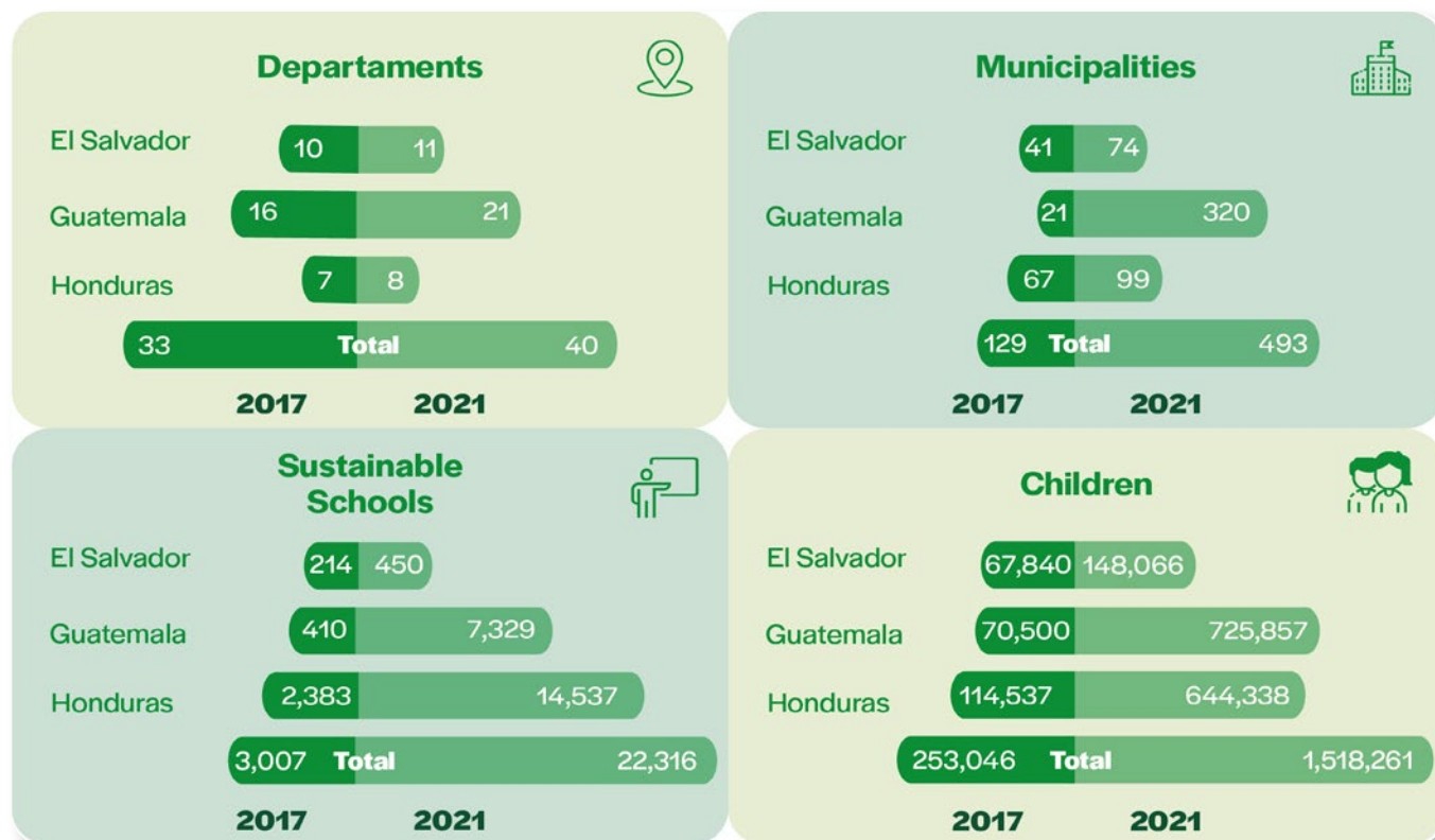
Figure 4: Progress description in El Salvador, Guatemala and Honduras