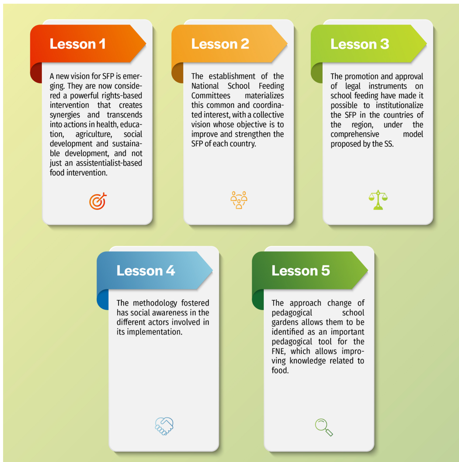
Figure 6: Among the main lessons learned from the implementation of the SS model, the following are highlighted