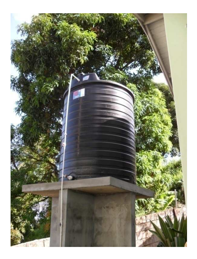
1000 gallon water tank installed at the Lowmans Primary School in St. Vincent and the Grenadines