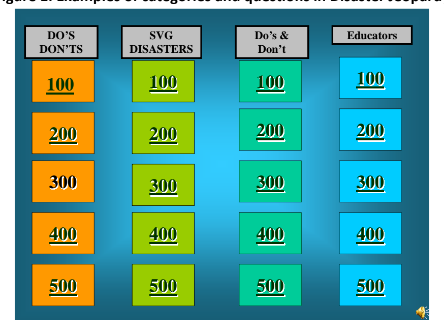
Figure 1: Examples of categories and questions in Disaster Jeopardy

A finished version of the Disaster Jeopardy Game consisting of selected categories and questions related to disaster risk management was presented to participants. Examples of categories and questions from that presentation are indicated in Figure 1 below.