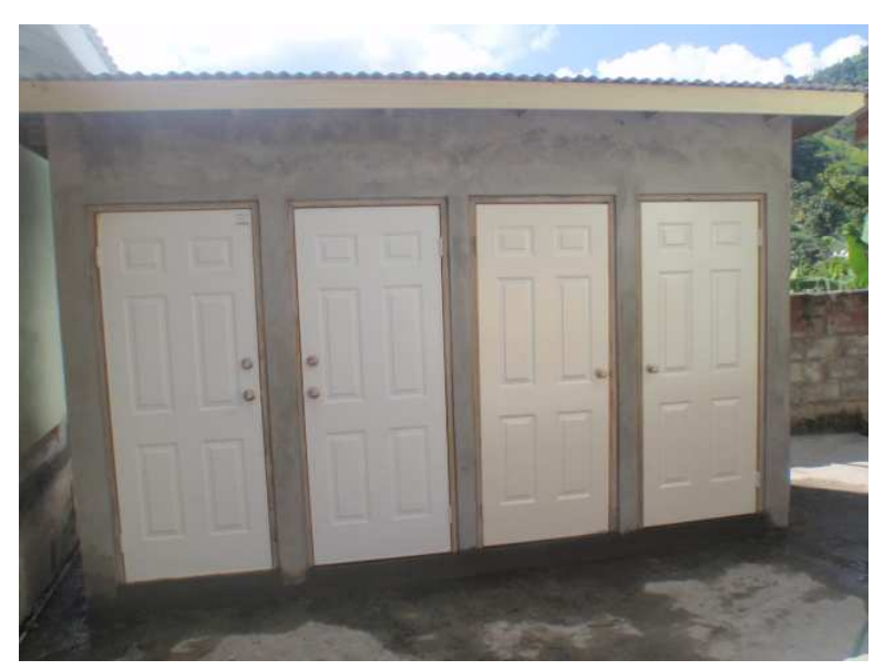
Four (4) shower units constructed at the Lowmans Primary School in St. Vincent and the Grenadines

Prior to the intervention, the physical structure of the building was in relatively good condition. The intervention enhanced the facilities by the construction of four (4) shower units and the construction of a 1000 gallon water tank installed as part of the rain water harvesting system.