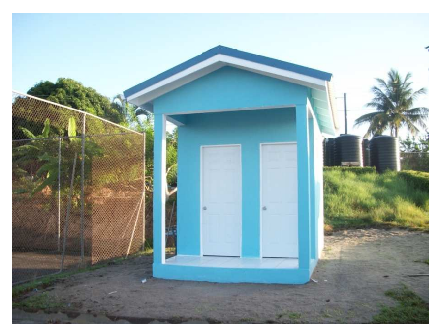
New showers constructed at Anse Ger Secondary School in Saint Lucia

The capacity of Anse Ger Secondary School , which is located in the rural community of Desrisseaux, quarter of Micoud on the east coast of the Saint Lucia, as an emergency shelter for one hundred and sixty (160) persons was enhanced through the construction of two (2) showers at the school. Micoud has an estimated total population of 16,284, of which three hundred and twenty-seven (327) persons reside in the community of Anse Ger.